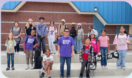
Sacramento City Unified School District Students

That is why we need YOUR help—Community Outreach Sponsors to provide students with access to an amazing live performance that could transform their lives.